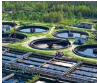
WATER & HVAC