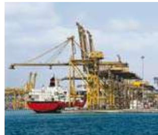
CRANES & OVERHEAD CRANES

In addition to foreseeing the market's application needs, Gefran forms partnerships with its customers to find the best way to optimise and boost the performance of various applications.